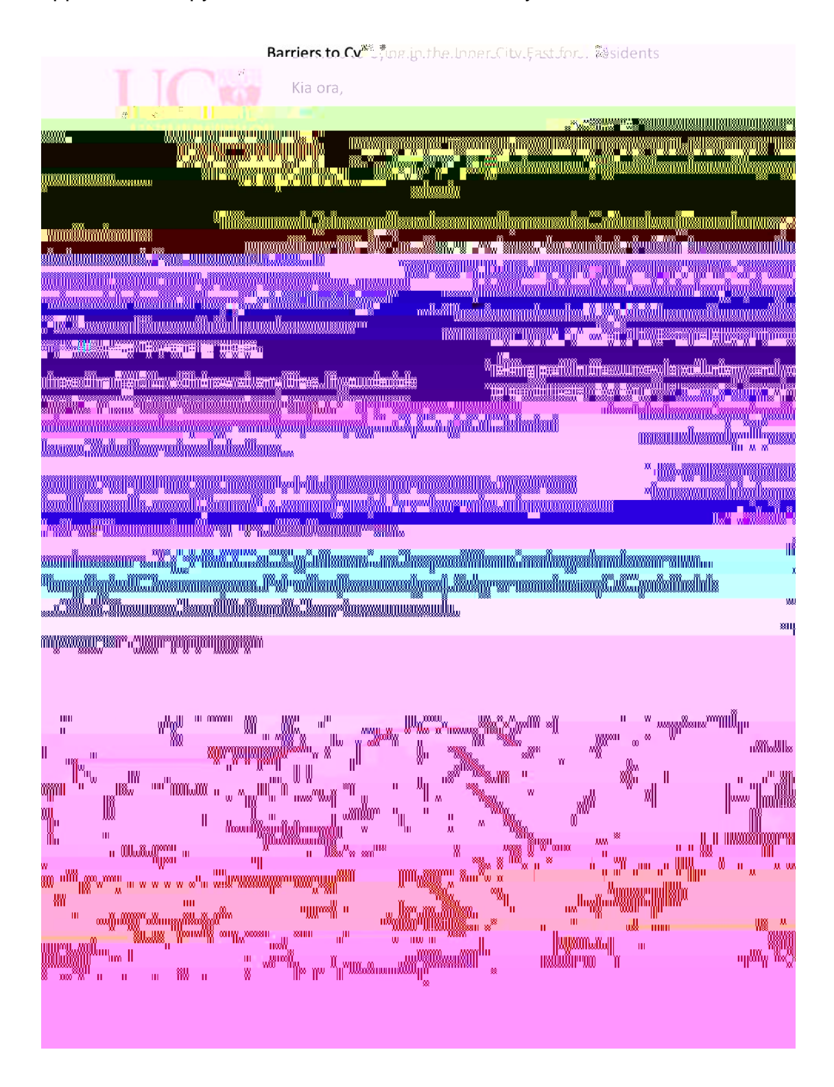
Appendix I - Copy of the Consent Form and Survey